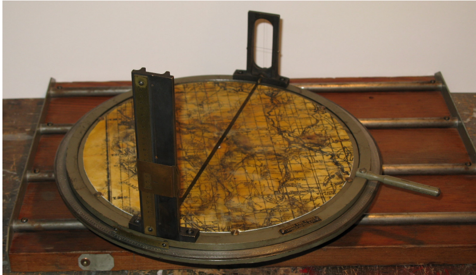
Osborne 1914 Fire-Finder

In 1914, the second year of commercial production by Leupold & Volpel Co., William B. Osborne modified his Fire-Finder; only slightly changing the front and rear upright sights, but discarding the center-pivot bar in favor of a circular ring around the outer rim of a newly designed 14" cast iron plate. This offered a more accurate azimuth reading on a far distant smoke. It was a transition that would prevail with all new Osborne Firefinder models of the future into the 21st century of production.